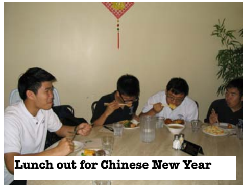
Lunch out for Chinese New Year

Chinese New Year was also celebrated with all the international students enjoying a lunch out at a local Chinese restaurant.