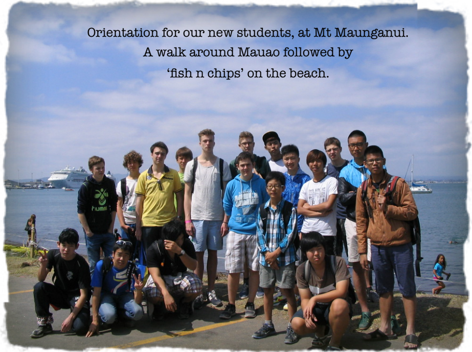
Orientation for our new students, at Mt Maunganui. A walk around Mauao followed by 'fish n chips' on the beach.