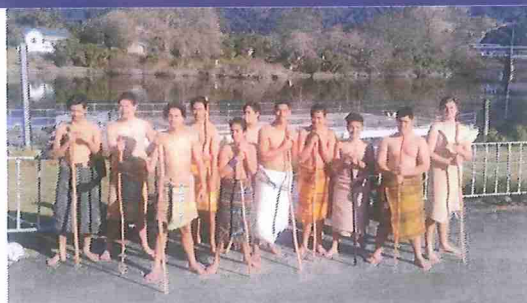
TBC Kapa Haka roopu at the Koroneihana in Waikato.